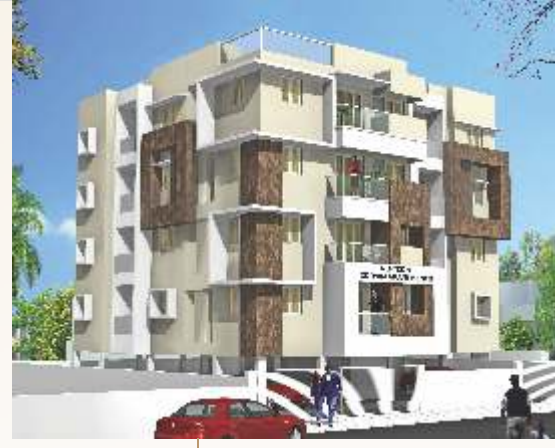
Nu-Tech Crown | Kodambakkam