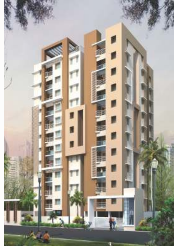
Nutech Sreenivas | Purasaiwalkam