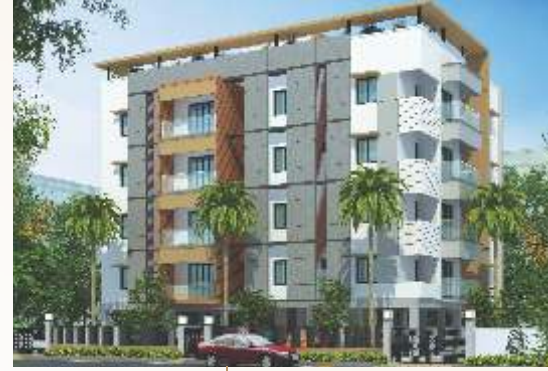
Nu-Tech Solitaire | Ashok Nagar