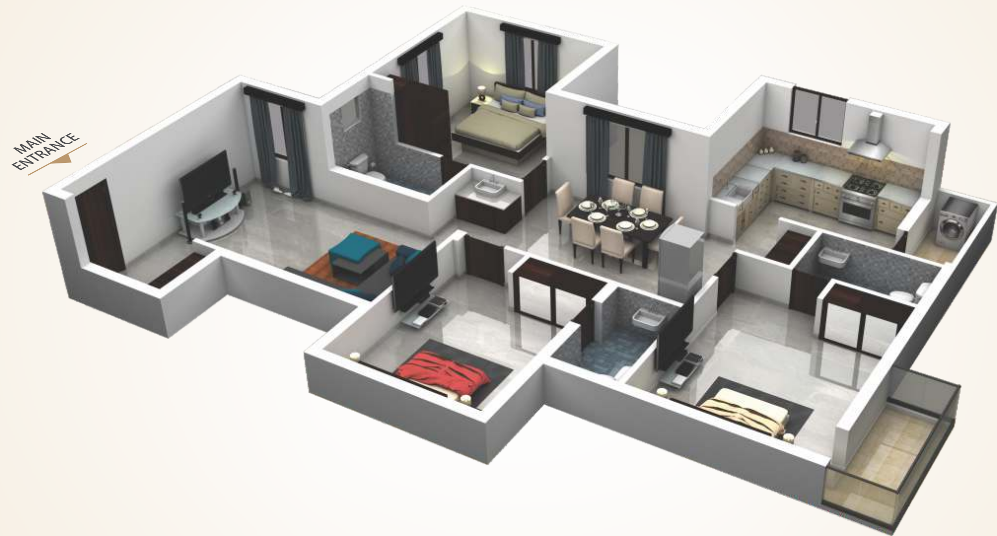
FLAT | 1C 2C 3C 4C