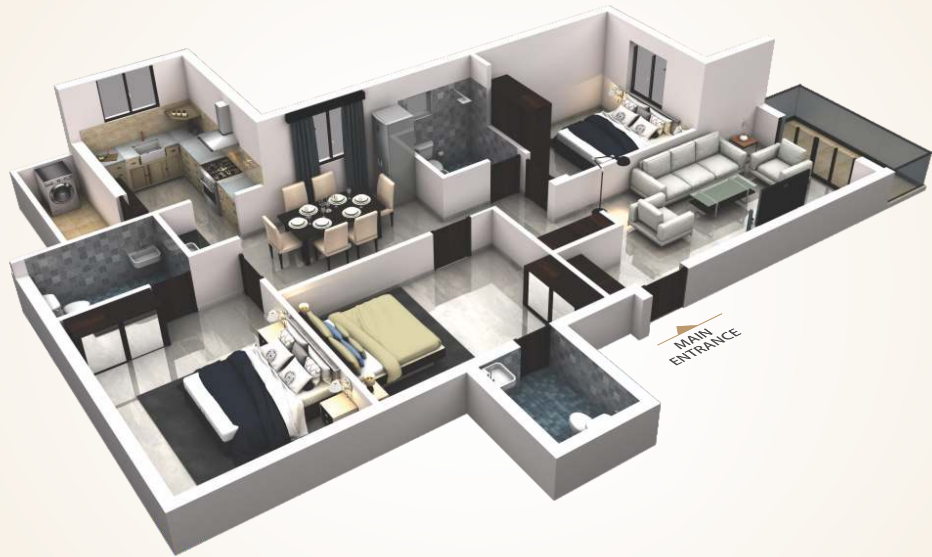
FLAT | 1B 2B 3B 4B