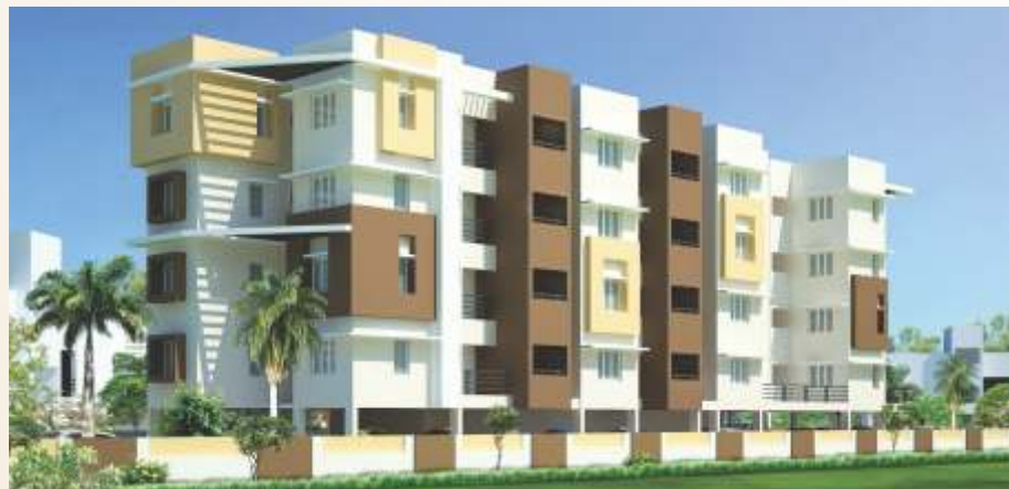
Nutech Greens | Porur