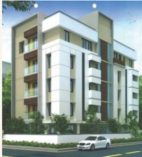
Nutech Virid H Block. | Anna Nagar