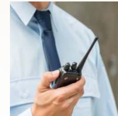
24 HOUR SECURITY