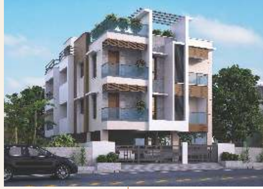
Nu-Tech Balaji Nagar | Saligramam