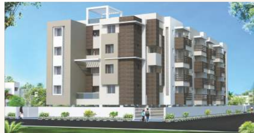
Nu-Tech Mind Space | Perungudi