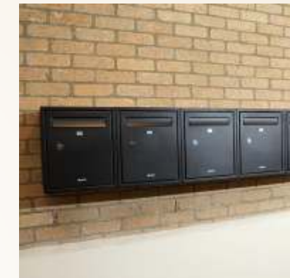
SEPARATE LETTER BOX