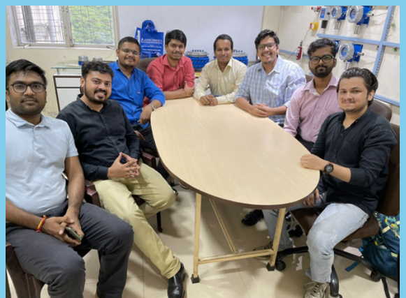
President's meet with YEAs