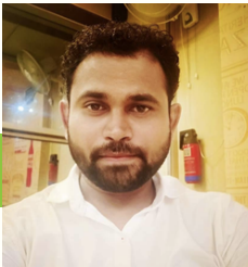
Amol Janjeere Blue Star Ltd.